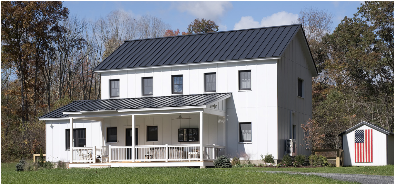
Unity Värm platform, built in 2016